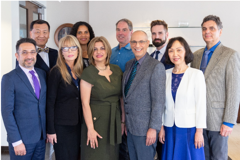
NCCAOM Board of Commissioners October 2019

PUBLIC PROTECTION THROUGH QUALITY CREDENTIALS