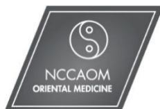
Oriental Medicine Dipl. O.M. (NCCAOM)®

The NCCAOM certification programs include Oriental Medicine (OM), Acupuncture (Ac), and Chinese Herbology (CH). The NCCAOM no longer offers examinations for the Asian Bodywork Therapy (ABT) program, however, NCCAOM ABT Diplomates keep their NCCAOM board certification current by maintaining their continued competencies. The three certification programs are accredited by the National Commission for Certifying Agencies (NCCA), whose standards are consistent with The Standards for Educational and Psychological Testing (AERA, APA, & NCME, 1999) and are applicable to all professions and industries.