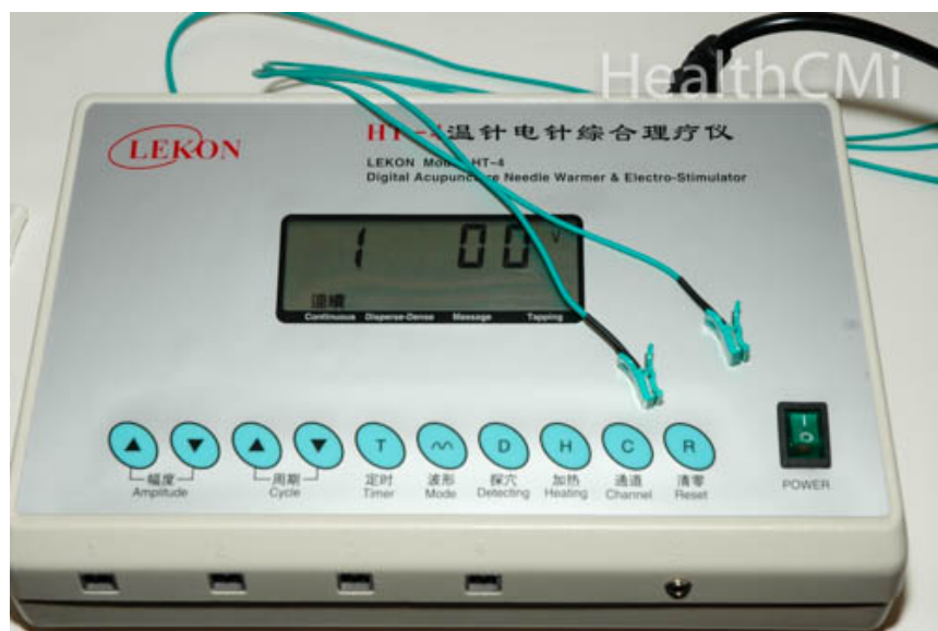
Example of an Electroacupuncture Device

Researchers collected hypertrophic scar samples from 2 randomly selected rabbits in every group at the 10th, 20th, and 30th day. All rabbits which had their samples taken once and were not reused. Based on the samples collected at the 10th, 20th, and 30th day, researchers analyzed and recorded the areas, thickness, color, blood vessel distribution, and softness of all hypertrophic scars. Samples were monitored with an optical microscope with staining to tabulate scar proliferation indexes. All groups showed progress in the scoring of hypertrophic scars, however, the scar proliferation indexes from group A and B were vastly different from that of the control group. Electroacupuncture significantly inhibited scar formation. This includes an overall smaller size, less thickness, less discoloration, better uniformity of tissue, and less deformities. Overall, electroacupuncture produced significantly superior patient outcomes over the control group. Group B, using alternating frequency electroacupuncture, had the best scores.